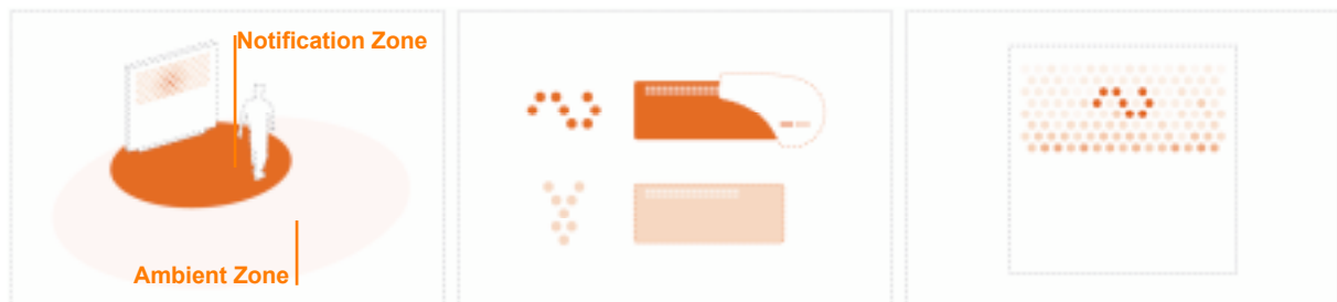
Figure 3: Identification via the Personal Aura artefact: People entering the notification zone (left) are identified according to their current professional role (middle) and their corresponding personal sign is displayed in the remote lounge (right).

As an overlay to the ambient patterns, static personal signs will be displayed, as soon as a team member enters the remote lounge space (see Figure 3). To ensure better recognisability, the individual signs are displayed at fixed positions on the wall. Besides the static personal signs dynamic, attention-catching patterns are used to signal communication requests towards remote team members. All light-patterns are designed in an ambient and rather abstract way to achieve an aesthetically pleasing and non-monotonic appearance.