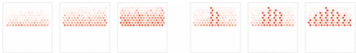
Figure 2: Ambient Patterns on the Hello.Wall expressing 3 different levels of mood (left) and presence (right).

We distinguish between two groups of patterns: ambient patterns , that represent general information like mood and presence, and notifications patterns , communicating individual or personalized messages. The Hello.Wall continuously displays dynamic ambient patterns interwoven with each other, representing the overall mood and general presence of the remote team members. To reduce complexity and support peripheral perception each parameter is divided into three levels (low, medium, high) with corresponding patterns.