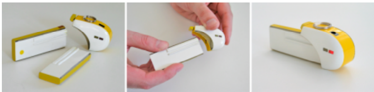
Figure 1: Personal Aura with reader module and two ID sticks (left), connection of reader module and ID stick (middle), active Personal Aura (right).

With the concept of the Personal Aura (PA) we adopted this natural behaviour and designed an artefact enabling persons to indicate their “professional role” and “availability” to remote team members. The artefact consists of two matching parts: the reader module which is able to “emulate” different identities or professional roles, and the ID stick containing a unique identity and optional personal information (see Figure 1). Each person has multiple ID sticks symbolizing different professional roles. If people want to signal their availability to remote team members they do so by simply connecting a specific ID stick to the reader module.