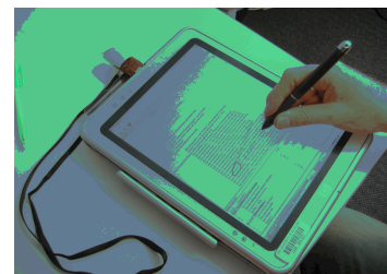
Figure 1 Penmarked

The structure of the remainder of this paper is as follows. The next section reviews related work, this is followed by the design proposal. A first prototype is described in the implementation section. After this the discussion section examines our design, development and evaluation process and how this may guide others working in this field. The last section details our future work plans and other research questions that this work raises.