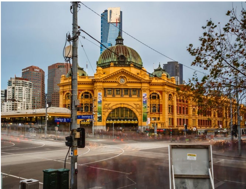
The hustle and bustle of Flinders Street

Your support also brings benefits of complimentary registration and conference dinner tickets as a token of our thanks for your help in creating a premier conference for the OzCHI community and its attendees.