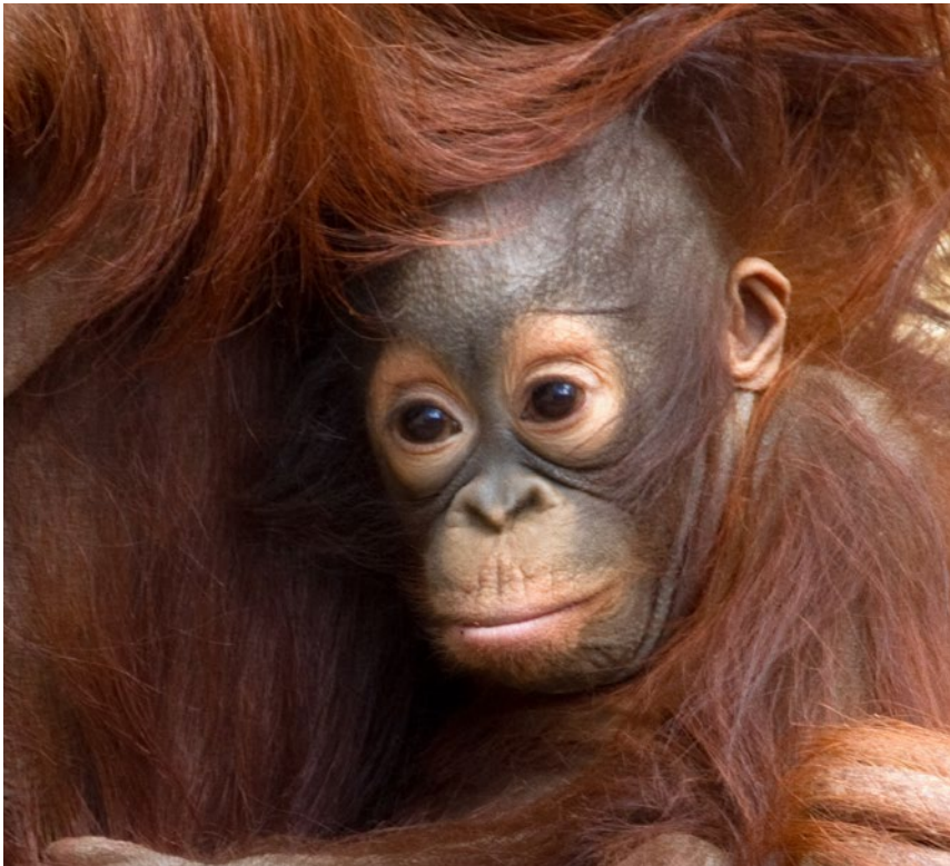
Baby Orangutan

OzCHI 2015 is hosting a conference dinner on Wednesday evening from 6:00pm – 10:00pm at the Melbourne Zoo in Parkville. The night will include private Animal experience tours, pre-dinner drinks and canapés followed by a sit down dinner in the Leopard Lodge. This is the premier OzCHI 2015 networking event attended by conference registrants.