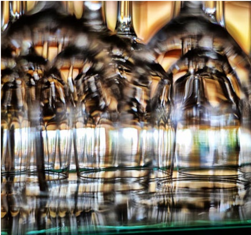
Wine Glasses

The Welcome Reception will be held on Tuesday evening from 6:00pm - 10:00pm at the Woodward Conference Centre on Level 10 of the Law Building at the University of Melbourne. Offering spectacular views of the city and surrounds, the event officially welcomes all conference participants to the conference.