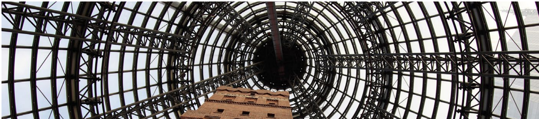
Coops Shot Tower

The conference website www.ozchi.org/2015 will be updated to include the detailed programme closer to the event. OzCHI 2015 is being held in cooperation with ACM and the conference proceedings will be published in the ACM digital library. Sponsors will be recognised on the front page of the Conference Website.