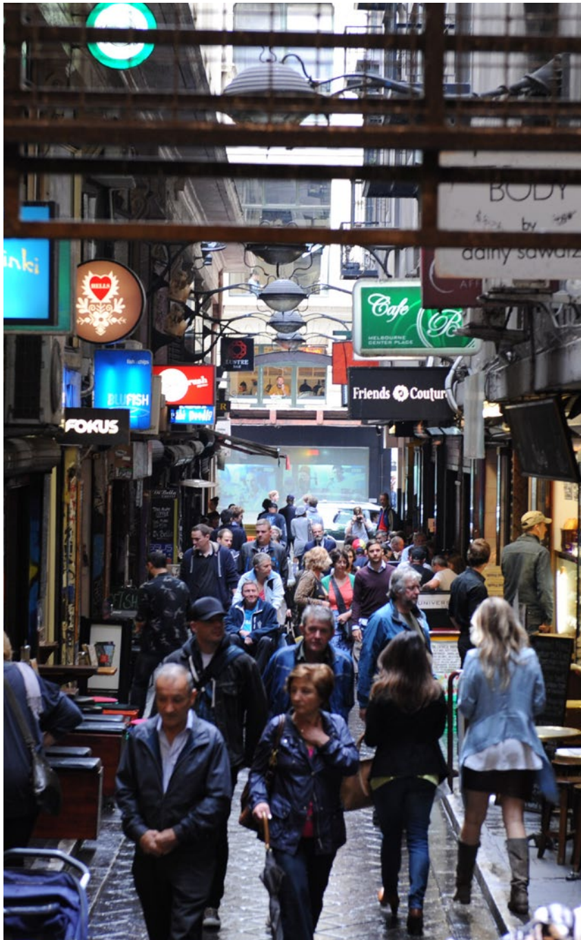
Melbourne Lane