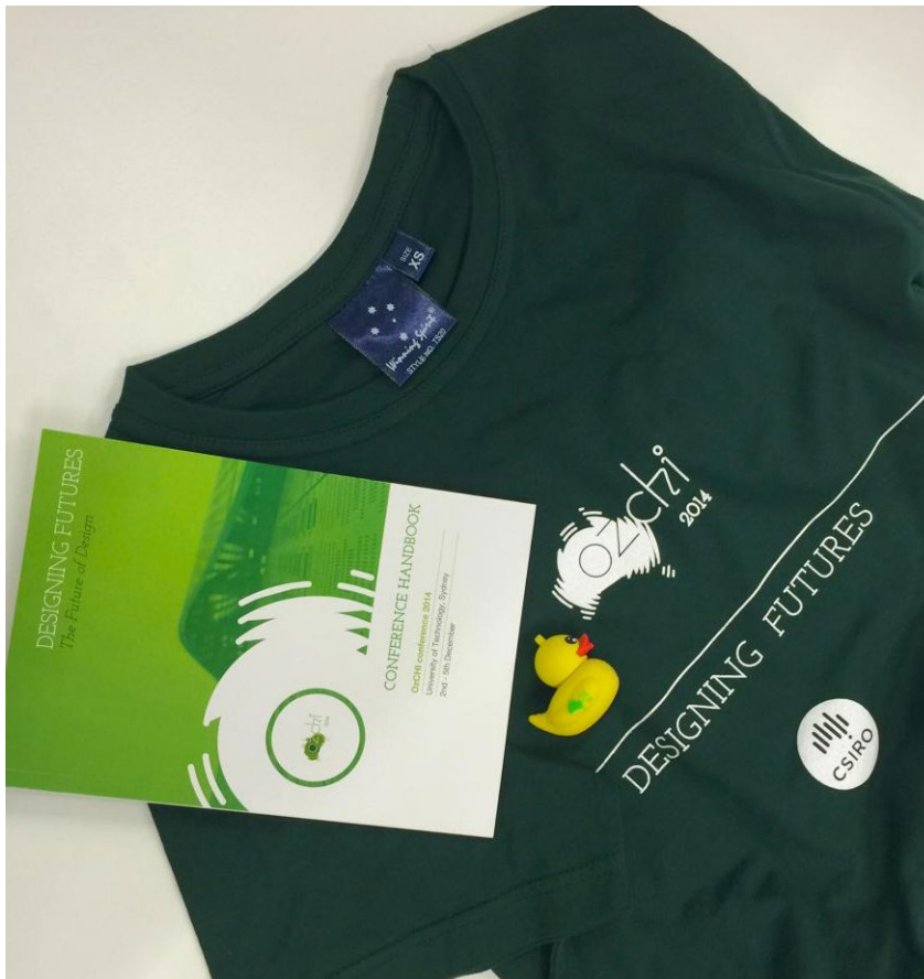
OzCHI 2014 T-Shirt, image by Tuck Wah, Leong

Your organisation's logo with OzCHI 2015 logo on T-shirts worn throughout the Conference by the team of 30 Student Volunteers and organisers throughout the 4 day program.